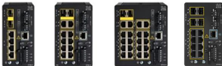
Figure 1. IE-3100 Rugged Series switches models