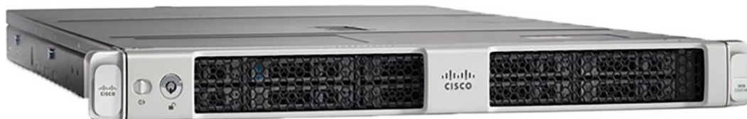
Figure 1. Cisco SNS-3715, SNS-3755, and SNS-3795 Secure Network Server

Figure 1 shows the Cisco Secure Network Server.