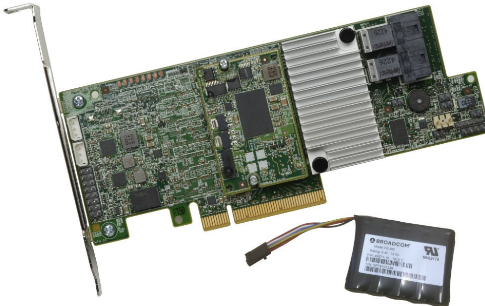
Figure 2. ThinkSystem RAID 730-8i 2GB Flash PCIe 12Gb Adapter

The following figure shows the ThinkSystem RAID 730-8i 2GB Flash PCIe 12Gb Adapter with the included external power module.