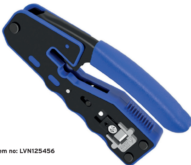
Item no: LVN125456