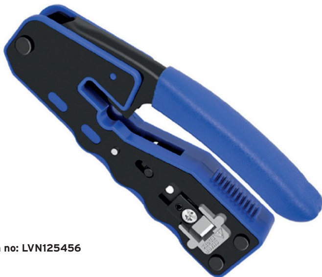
Item no: LVN125456