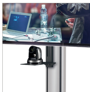
Accessories such as VC Shelves & media storage can be fitted easily (available separately)