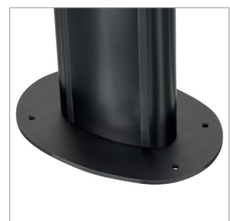
8mm steel base secures the column to the floor