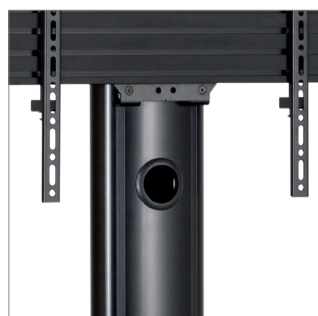
Integrated cable management throughout the vertical column