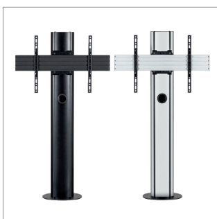
Available in Black or Silver & Black