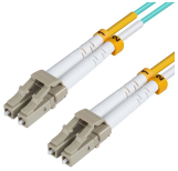
MicroConnect Optical Fibre Cable, LC-LC, Multimode, Duplex, OM3 (Aqua Blue) 1.5m MPN: FIB4420015