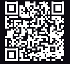
OTD140 360° VIEW

The OTD140 outdoor router features a dedicated and durable IP55 plastic housing and an integrated mounting bracket, making this outdoor 4G router easy to deploy and capable of withstanding outdoor environmental conditions. Beyond that, this outdoor router is equipped with LTE Cat 4 connectivity, compatibility with RMS for remote management capabilities, and two PoE In/Out Ethernet ports.