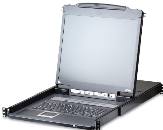
CL5716I Front View