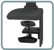
SHOWN WITH WORKFIT-TL SIT-STAND WORKSTATION

INCLUDED: STANDARD 2-PIECE DESK CLAMP ATTACHES TO SURFACE EDGE