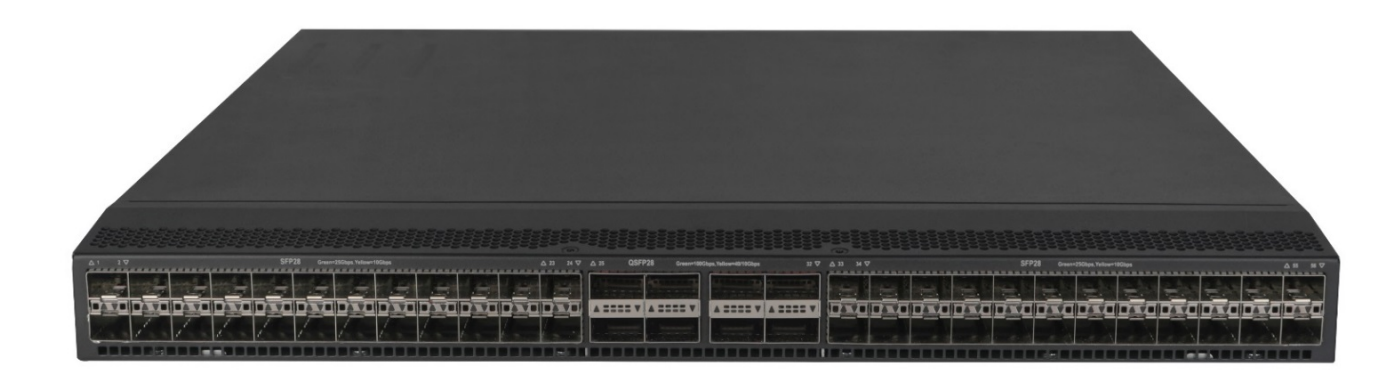
HPE FlexFabric 5945 48SFP28 8QSFP28 Switch (JQ074A)

With the increase in virtualized applications and server-to-server traffic, customers require spine and ToR switches that can meet their throughput requirements. With the HPE FlexFabric 5945, data centers can now support up to 100 Gb per port, allowing high-performance server connectivity and the capabilities to handle virtual environments. This is available in the low-latency HPE FlexFabric 5945 Switch Series..