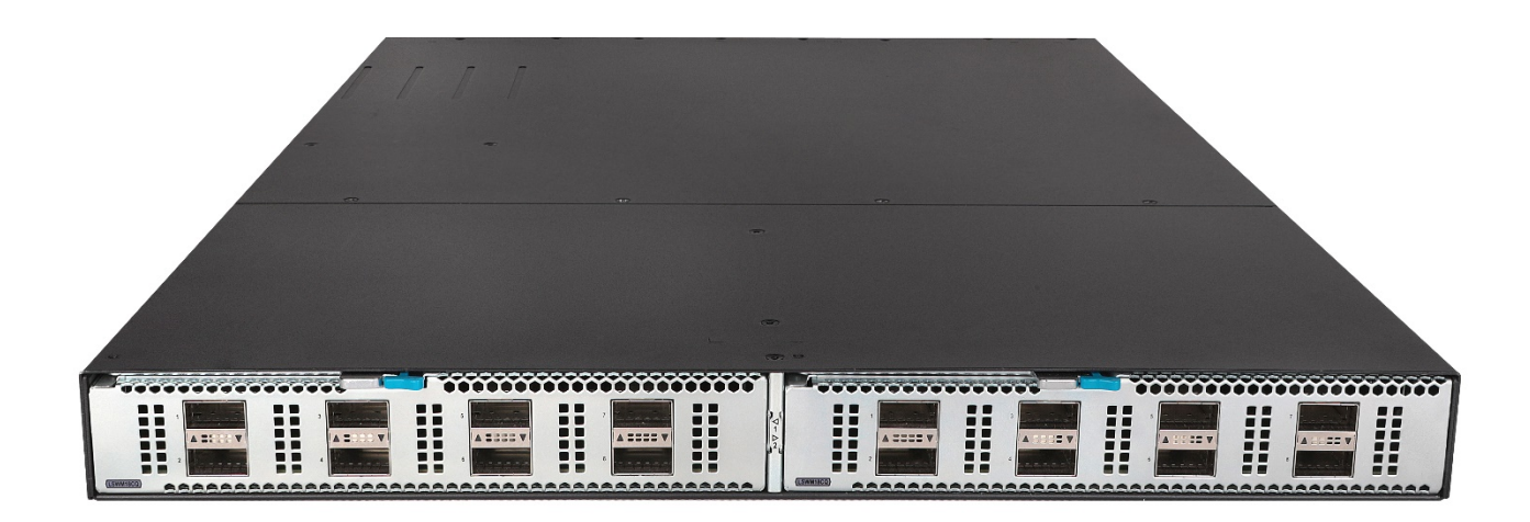
HPE FlexFabric 5945 2-slot Switch (JQ075A)