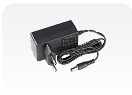
24 V 1.2 A power adapter