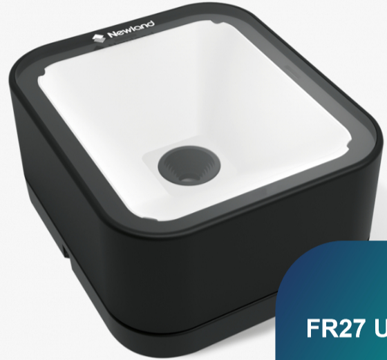
FR27 Urchin Stationary Scanners