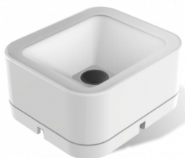
Available in white on request

Mindful that the FR27 Urchin can suit access control and kiosk applications, its case has a design that allows you to manipulate the cable for mounting portrait or landscape. It also has threaded fixing points for vertical mounting.