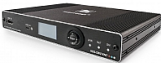
KDS-SW2-EN7 auto-switch encoder with HDMI and USB-C inputs

High-performance, highly-scalable, AVoIP auto-switch encoder over 1G network