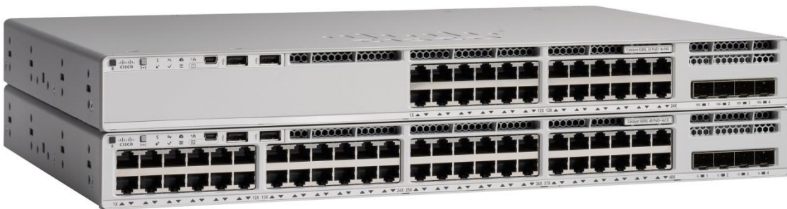
Figure 1. Cisco Catalyst 9200 Series switches

The Cisco Catalyst 9200 Series is made up of four modular (C9200 SKUs) and eight fixed (C9200L SKUs) switch models.