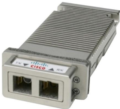
Figure 12. Cisco 10-Gbps Ethernet X2 Transceiver