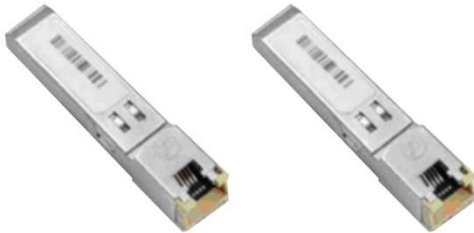
Figure 8. Cisco Copper Gigabit Ethernet SFP Modules

For even more cabling flexibility, the MDS 9000 Family offers copper Gigabit Ethernet SFP modules. Based on the 1000BASE-T standard, Cisco Copper Gigabit Ethernet SFP modules (Figure 8) provide cost-effective connectivity for data center applications. Cisco Copper Gigabit Ethernet SFP modules (part number DS-SFP-GE-T) allow the use of standard Category 5 unshielded twisted pair (UTP) cabling for Ethernet connectivity.