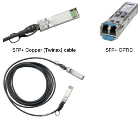
Figure 5. Cisco 10GBASE SFP+ Modules

Cisco 10-Gbps Ethernet SFP+ modules (Figure 5) provide 10-Gbps Ethernet connectivity for the Cisco MDS 9500 10-Gbps 8-Port FCoE Module and MDS 9250i Multiservice Fabric Switch.