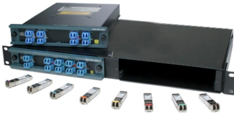
Figure 13. Cisco CWDM Extended Distance SFP Solution

The CWDM SFP solution enables the transport of up to eight channels over one pair of single-mode fiber strands, enabling enterprises to increase the bandwidth of an existing optical infrastructure without adding new fiber strands. The solution can be used in parallel with other Cisco SFP devices on the same platform.