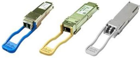
Figure 6. Cisco 40GBASE SFP+ Modules