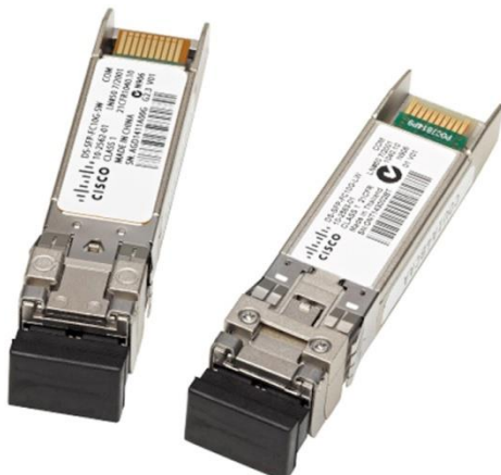
Figure 4. Cisco 10-Gbps Fibre Channel SFP+ Modules

Cisco 10-Gbps Fibre Channel SFP+ modules (Figure 4) provide Fibre Channel connectivity for the 10-Gbps Fibre Channel ports on the MDS 9000 Family platform. Two types are available: the Cisco Fibre Channel Shortwave SFP+ (part number DS-SFP-FC10G-SW) and the Cisco Fibre Channel Longwave SFP+ (part number DS-SFP-FC10G-LW).