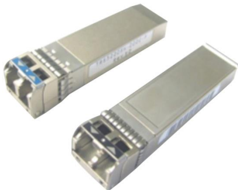
Figure 11. Cisco 16-Gbps Fibre Channel SFP+ Transceivers

The Cisco 16-Gbps Fibre Channel SFP+ Transceivers (Figure 11) provide Fibre Channel connectivity for 4/8/16-Gbps ports on the MDS 9000 Family platform. Three types are available: the Cisco Fibre Channel Shortwave SFP+ (part number DS-SFP-FC16G-SW), the Cisco Fibre Channel Longwave SFP+ (part number DS-SFP-FC16G-LW), and the Cisco Fibre Channel Extended Longwave SFP+ (part number DS-SFP-FC16GELW). Each offers 4/8/16-Gbps autosensing Fibre Channel connectivity.