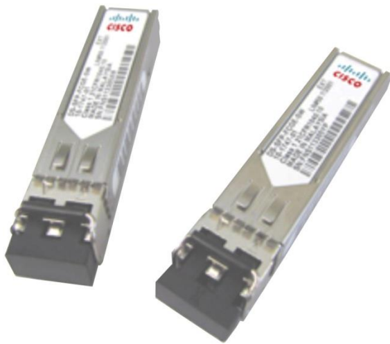
Figure 2. Cisco 4-Gbps Fibre Channel SFP Modules

Cisco 4-Gbps Fibre Channel SFP modules (Figure 2) provide cost-effective Fibre Channel connectivity for 1/2/4-Gbps ports on the MDS 9000 Family platform. Three types are available: the Cisco Fibre Channel Shortwave SFP (part number DS-SFP-FC4G-SW), the Cisco 4-km Fibre Channel Longwave SFP (part number DS-SFP-FC4G-MR), and the Cisco 10-km Fibre Channel Longwave SFP (part number DS-SFP-FC4G-LW). Each offers 1/2/4-Gbps autosensing Fibre Channel connectivity.