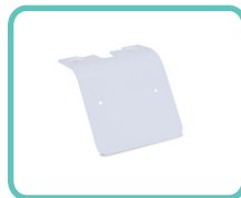
SIDE-MOUNT PRINTER BRACKET, SLIM 2.0 98-468