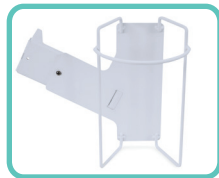
SIDE-MOUNT WIPES HOLDER, SLIM 2.0 98-451