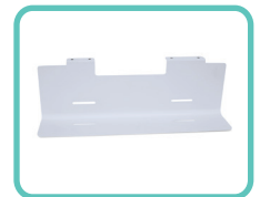
FRONT SHELF, SLIM 2.0 98-476

Download additional resources at ergotron.com .