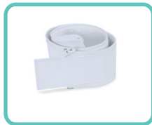
VINYL CORD COVER KIT 98-453