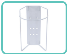
T-SLOT WIPES HOLDER 98-450