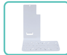
SIDE-MOUNT SCANNER HOLDER, SLIM 2.0 98-466