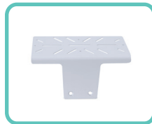
T-SLOT SCANNER AND PRINTER HOLDER 98-465