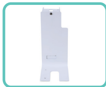
SIDE-MOUNT SCANNER BRACKET, SLIM 2.0 98-467