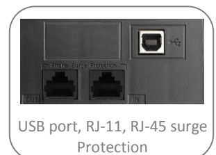
USB port, RJ-11, RJ-45 surge Protection