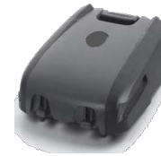
KTBTRYRS50EAB00-01 Standard Lithium Ion battery, 970 mAh