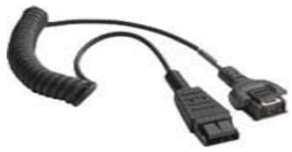
25-114186-03R Adapter cable with a coiled section for WT41N0