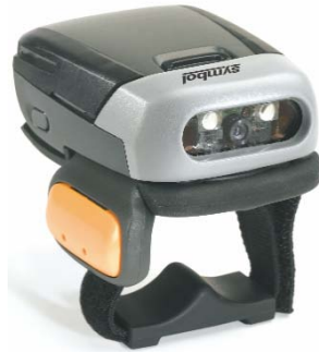
RS507-IM20000STWR Imager with trigger and standard battery