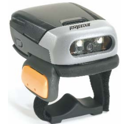
RS507-IM20000STWR Imager with trigger and standard capacity battery