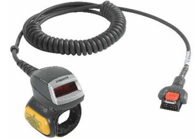
RS419-HP2000FLR Ring scanner with cable to waist