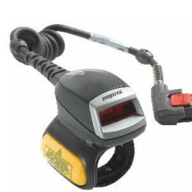
RS419-HP2000FSR Ring scanner with cable to wrist