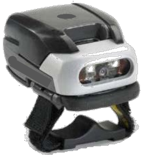
RS507-IM20000ENWR Imager without trigger and extended battery