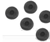
KT-126574-01R Replacement ear pads foam, (5 pk)