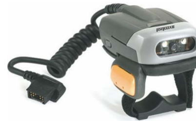
RS507-IM20000CTWR Corded imager with trigger