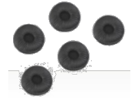
KT-126580-01R Replacement earpads leatherette (5 pk)