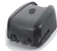
KTBTRYRS50EAB02-01 Extended Lithium Ion battery, 1940 mAh