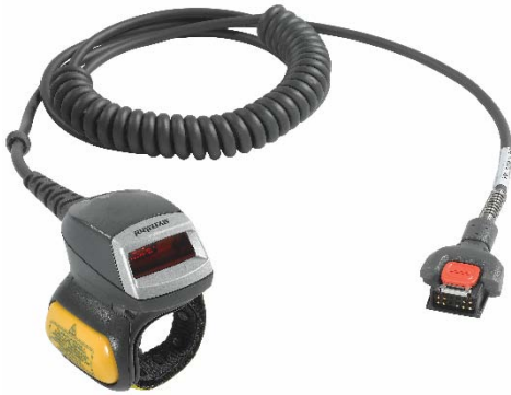
RS419-HP2000FLR Ring scanner for WT41 hip mounted.