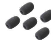
KT-126579-01R Replacement windsocks (5 pk)