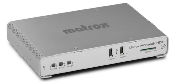
MATROX MONARCH HDX CONNECTIONS

Matrox Monarch HDX Dual-Channel H.264 Encoder / MHDX/I. Videon enimmäisresoluutio: 1920 x 1080 pikseliä, Suurin kuvataajuus: 60 fps. Koteloon materiaali: Metalli, Sertifiointi: EM: FCC Class A, CE Mark Class A, ACMA C-Tick Mark, VCCI UL/CUL(UL60950-1), TUV-GS(EN60950-1),.... Mitat (LxSxK): 216 x 142 x 36 mm