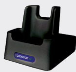
■ 94ACC0208 Single Slot Dock Charge only