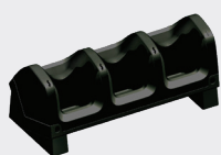
■ 94ACC0206 3-Slot Dock