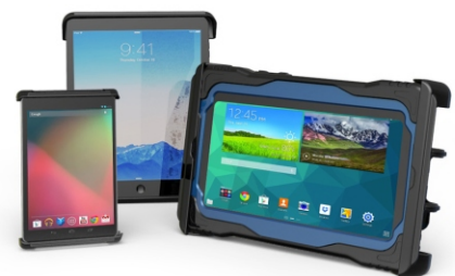
RAM@ Tab-Tite™ Universal spring loaded holder for supporting virtually any size tablet

RAM Mounting Systems 8410 Dallas Ave S Seattle, WA 98108 Phone: (206) 763-8361 Fax: (206) 763-9615 www.rammount.com support@rammount.com