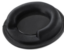
P/N: RAP-279C RAM@ Portable Friction Dashboard Mount for Suction Cups