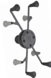
X-Grip™ II - Small Tablets P/N: RAM-HOL-UN8BU