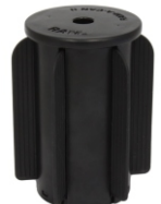
P/N: RAP-299-3U RAM-A-CAN II™ Cup Holder Wedge Base