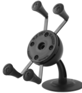
P/N: RAP-SB-180-UN7U RAM@ Lil' Buddy™ Flex Adhesive Mount with X-Grip® Phone Holder