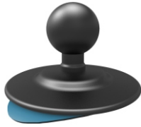
P/N: RAP-B-378U Flex adhesive ball base adheres to any flat or curved dashboard Surface