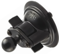
P/N: RAM-B-224-1U Twist-Lock suction cup base powerful suction for any window or windshield