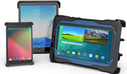
RAM@ Tab-Tite™ Universal spring loaded holder for supporting virtually any size tablet

RAM Mounting Systems 8410 Dallas Ave S Seattle, WA 98108 Phone: (206) 763-8361 Fax: (206) 763-9615 www.rammount.com support@rammount.com