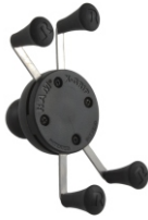
X-Grip™ Phone Holder Small P/N: RAM-HOL-UN7BU Large P/N: RAM-HOL-UN10BU