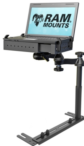
Complete Vehicle Mount RAM-VB-196-SW1

Slotted design allows this base to fit a wide variety of vehicles. This base will not interfere with factory installed console in most installations. Product has 16.188" min base width but accommodates as low as 9" hole center seat leg bolts.