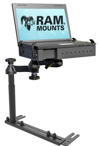
Reverse Configuration RAM-VB-196-1-SW1