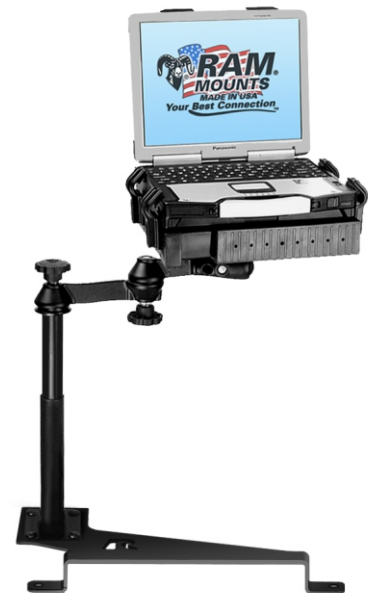
Complete Vehicle Mount RAM-VB-172-SW1

Installs in minutes with no drilling required. Lifetime warranty!