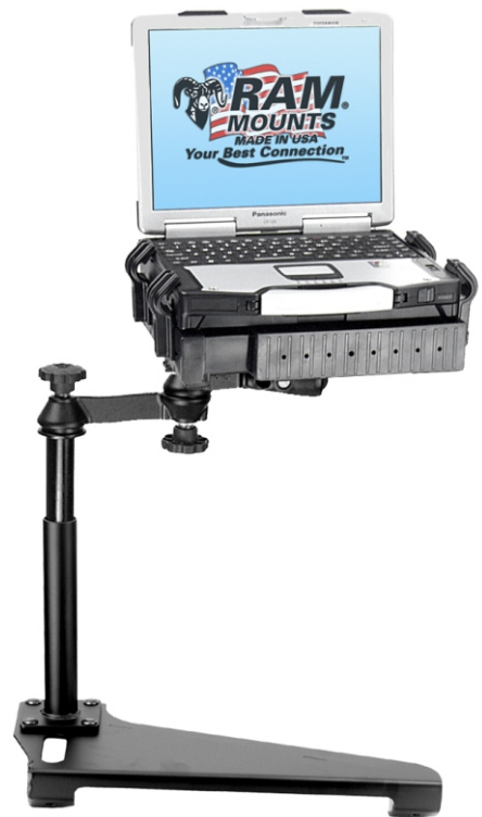
Complete Vehicle Mount RAM-VB-152-SW1