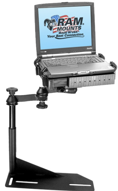
Shown In Use

Rugged steel construction Lifetime warranty