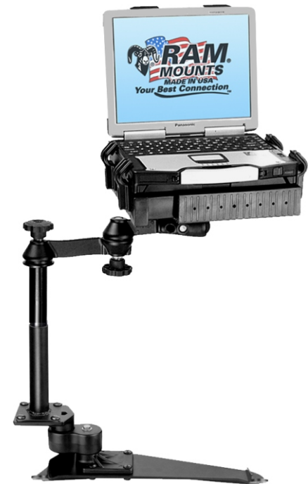
Shown In Use

Rock solid construction Lifetime warranty