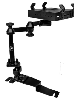
Complete Vehicle Mount RAM-VB-161