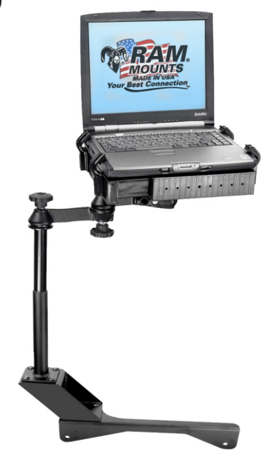
Complete Vehicle Mount RAM-VB-145-SW1

8410 Dallas Ave S Seattle, WA 98108 Phone: (206) 763-8361 Fax: (206) 763-9615 www.rammount.com support@rammount.com