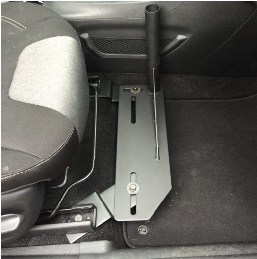
Image of Jeep Cherokee installation. Note the orientation of the seat leg brackets. The supplied stabilizer foot should be installed within the slot closest to the center hump of the vehicle.

RAM Mounting Systems 8410 Dallas Ave S Seattle, WA 98108 Phone: (206) 763-8361 Fax: (206) 763-9615 www.rammount.com support@rammount.com