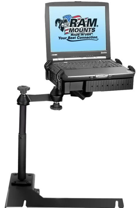
Shown In Use

Low profile design minimizes intrusion on passenger side leg space. This base will not interfere with factory installed consoles located on transmission hump.