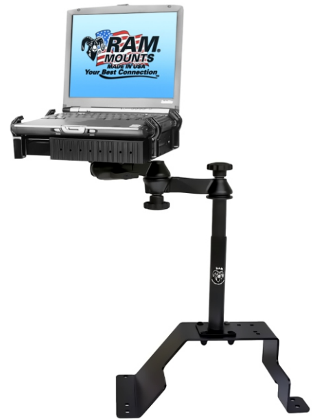
Complete Vehicle Mount RAM-VB-107-SW1

Central mounting location moves pole away from passenger leg space. There base is formed from one piece of steel. Drilling may be required on vehicles with 60-40 split seats.