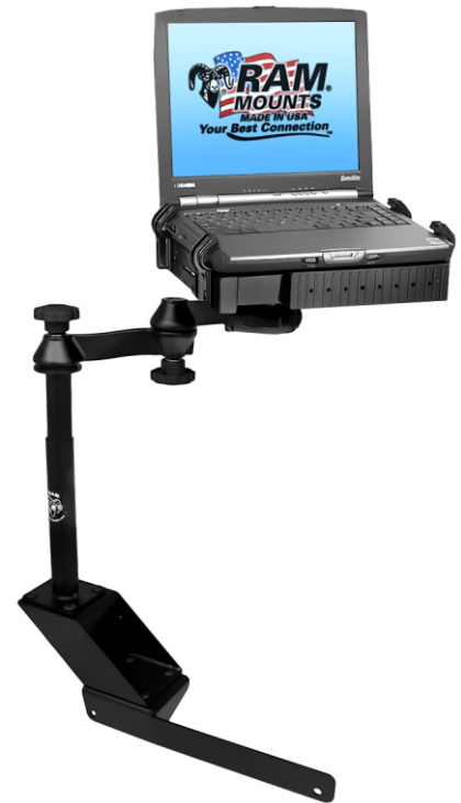
Complete Vehicle Mount RAM-VB-105-SW1

Low profile design keeps mount away from passenger leg space. This base will not interfere with factory installed console or 4WD lever.