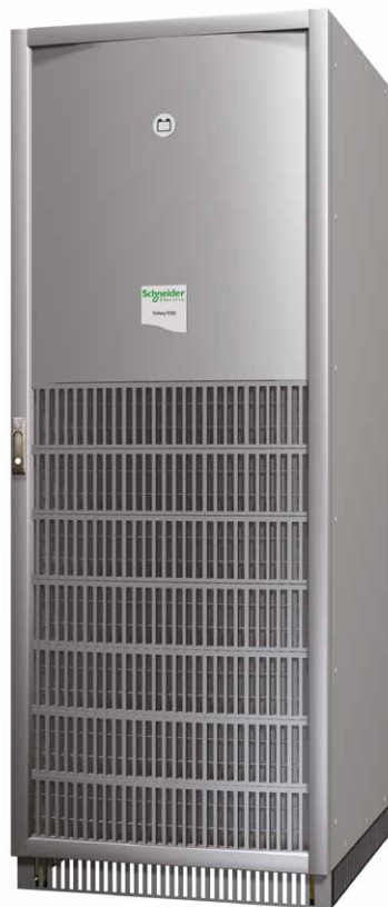
Galaxy 5500 Battery Cabinet