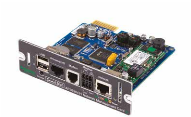
Schneider UPS Network Management Card 2 with environment monitoring, out-of-band access, and modbus