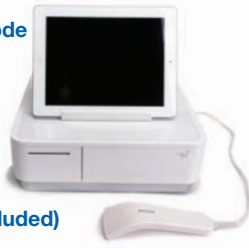
(Tablet Not Included)